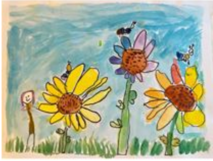
AMBER X., AGE 4