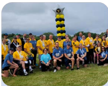
WEAR YELLOW DAY JULY 12

REGISTER AND GET MORE INFO AT THE LINKS BELOW