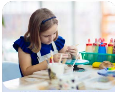
CHILDREN'S ARTWORK CONTEST DEADLINE JULY 22