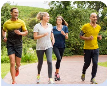
NATIONAL VIRTUAL RACE TO CURE SARCOMA JULY 20