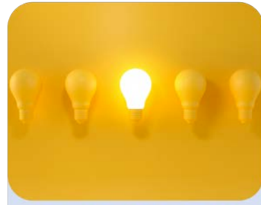
LIGHT UP FOR SARCOMA JULY 26