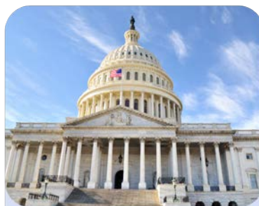
SARCOMA HILL DAY JULY 18